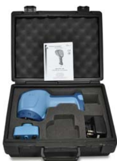
Standard Kit Case