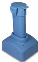
Battery Recharging Station

A/C Power Adapter - The 115/230 A/C power adapter allows for continuous operation. Included with certain models or may be ordered separately.