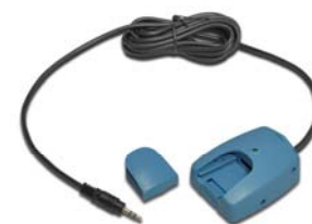
Remote Laser Dock