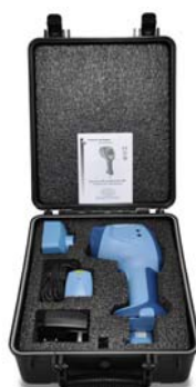
Deluxe Kit Case