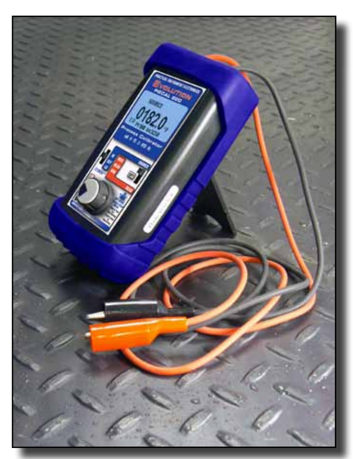
Flip out stand for bench use