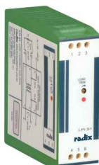
LOOP POWERED ISOLATOR 4-20mA INPUT/OUTPUT, NO TRIM FOR LOAD, NO SUPPLY LPI61